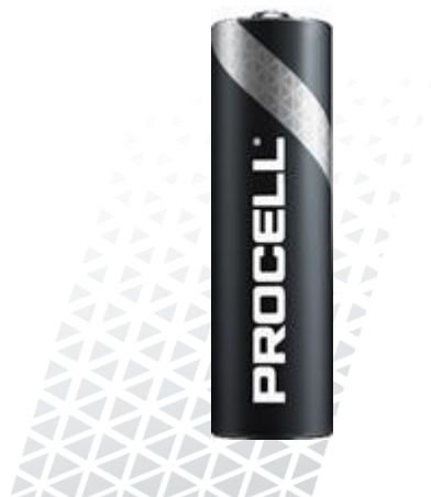
Size: AA (LR6) PC1500